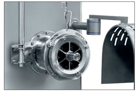
Worm housing nut with smooth running thread and crane