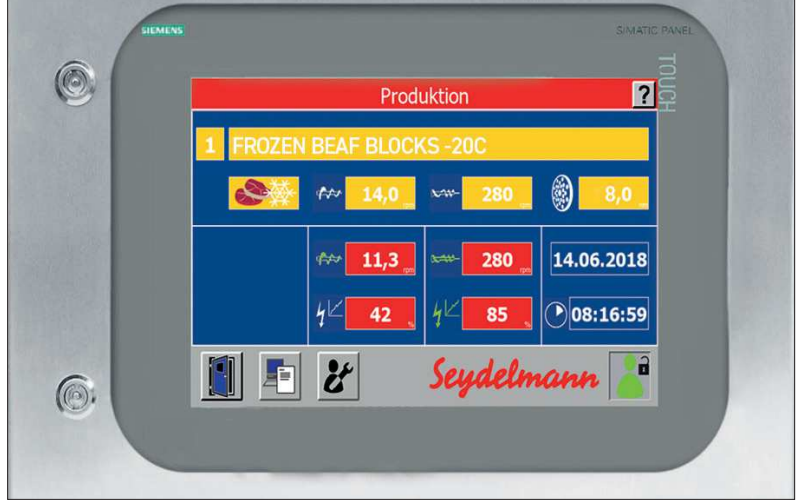
Command 700 W

info@seydelmann.com Tel. +49 (0)711 / 49 00 90-0 Hoe www.seydelmann.com Fax +49 (0)711 / 49 00 90-90 701