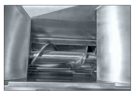
Hopper with feeding worm