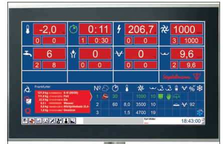
Auto-Command 4000 (optional)