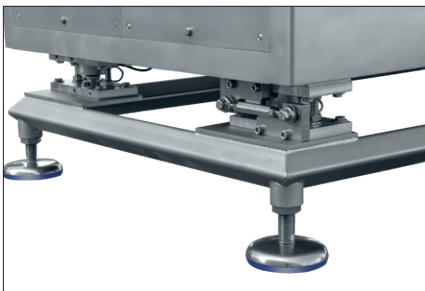
Weighing unit (optional)