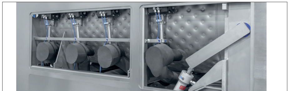
Pillow Plates (optional)