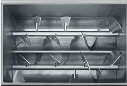
Top view: Hopper