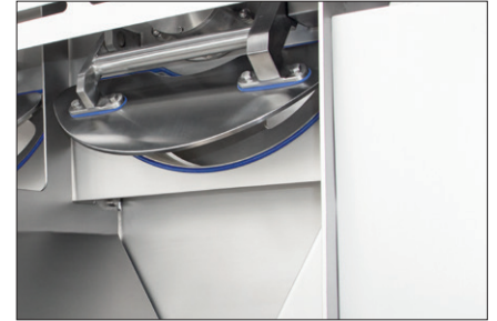
Hydraulic discharge flap