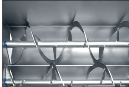
Design with mixing ribbons