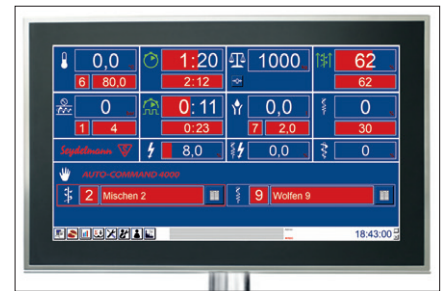
Auto Command Touch 4000 (optional)