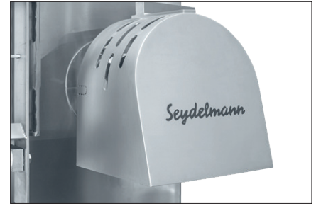
Outlet protection device