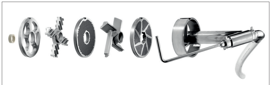
Separating set (optional)