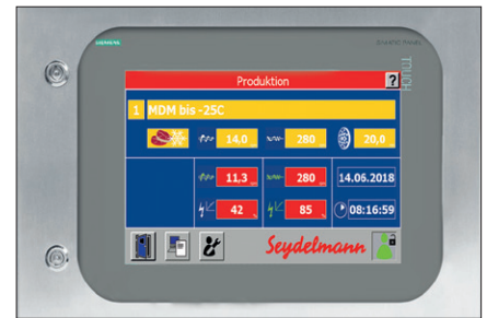
Command 700 W (optional with frequency controlled AC-6 main drive)