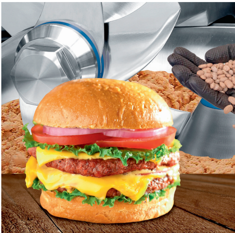
In a bowl cutter, the complete production process of minced meat-like meat substitutes, such as burger patties, can be operated in one machine.